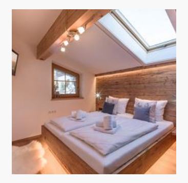
1-7 Personen · 3 Bedrooms · 142 m<sup>2</sup>