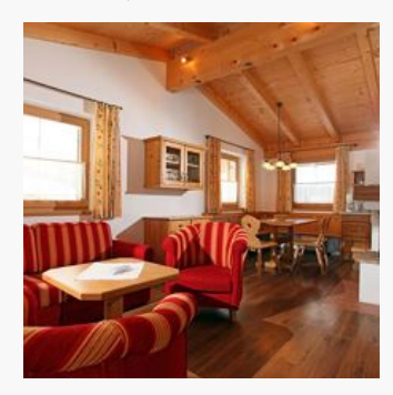
1-4 Personen · 2 Bedrooms · 73 m<sup>2</sup>