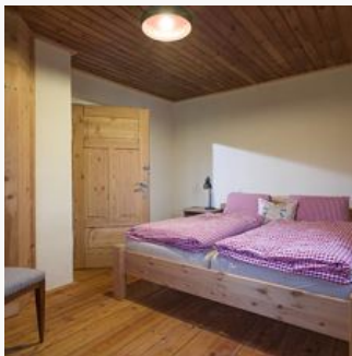
2-4 Personen · 2 Bedrooms · 50 m 2