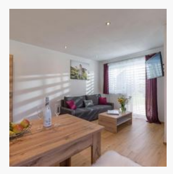
1-4 Personen · 1 Bedrooms · 52 m<sup>2</sup>