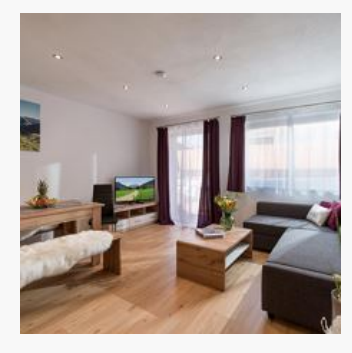
Our spacious holiday flat Wilde Kaiserin comprises a generous kitchen/living room with a dining area and TV. The kitchen is equipped with a dishwaher, coffeemaker, electric kettle, stove, oven, etc.)...