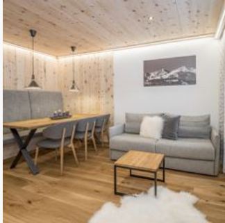
2-6 Personen · 2 Bedrooms · 80 m 2